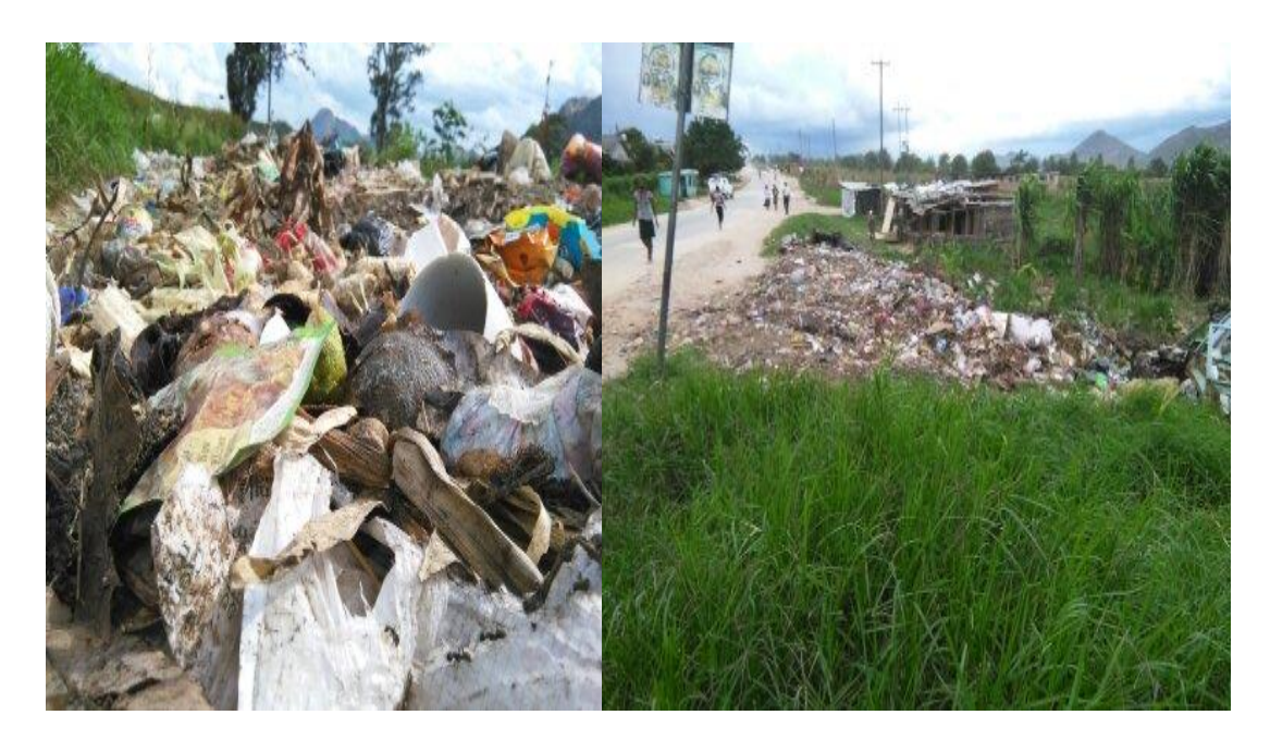
Plate 1.

In addition, as observed by the researcher, there were a number of health problems in the environment. While safe water and sanitation facilities are present in the city there is unreliable functioning, prolonged cuts leading to use of unsafe alternatives which undermine health, as well as waste disposed in open pits and public sites as shown in plate 4.1 below.