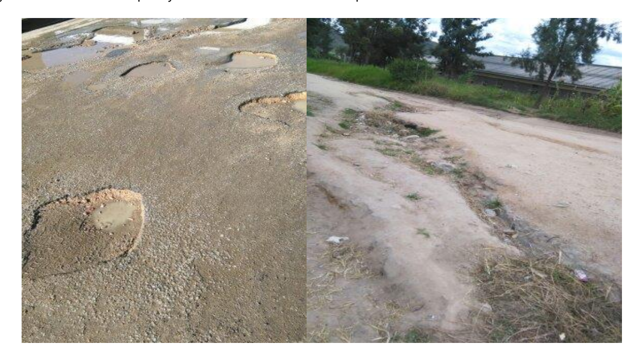
Plate 2

From the observations conducted by the researcher, it was noted that roads both in residential areas and the major ones are in a dilapidated state which has been worsened by heavy rains which slow down movement of vehicles and even cause road accidents. Plate 4.2 below shows the condition of many of the roads in Mutare city which if no action is quickly taken will soon be closed for public use.