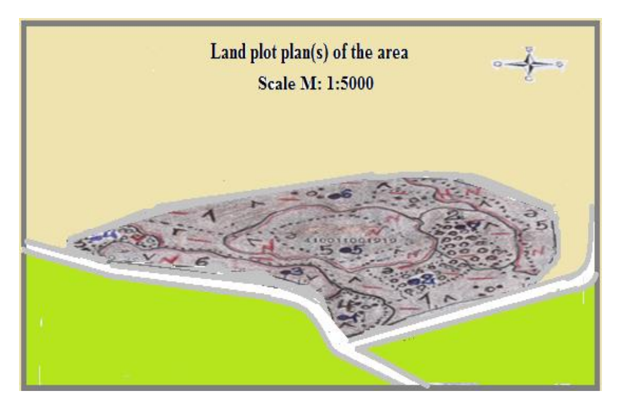
Fig.1 Land plot plan (s) of the areo the village Malham of the Shamakhi

With an area of 2.8 hectares and on the EIA of Gyandja RUCN in the village. B / Bagmanli with an area of 4.45 hectares. It has been proven by the results of numerous experiments and researches, when choosing the right crop irrigation technology, it is imperative that we study the agro-soil, natural-economic, geographical relief of the territory and the degree of natural moisture and other characteristics based on the monitoring of multi-year data on the object of research, which we should study. specified in the example of the Shamakhi region, where it was decided to set up experiments in the period 2007-2009. for which it is shown in the table! water-physical and agro-chemical properties of the soil of the object of research, experiments that were carried out on the territory of the village Malham of the Shamakhi region. The results of our analysis showed that on the territory of the Shamakhi region widespread mainly degraded mountain brownish-brown soils are mainly widespread.