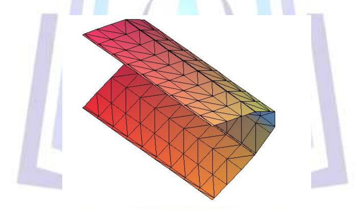
Figure 1: The normal form of a saddal- node bifurcation, where r ranges from \pi to- \pi using mapleTheorem

the following theorem related to this kind of bifurcation.