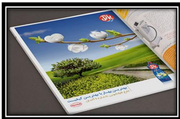
Image Exaggeration in New Iranian Advertisement

This image is an Iranian ad 90s and is related to Pril dishwashing liquid. According to Roland Barthes at first what needs to pay attention is ad text. In the upper right corner, pril the word is written in the circular and in line with the word of pril on