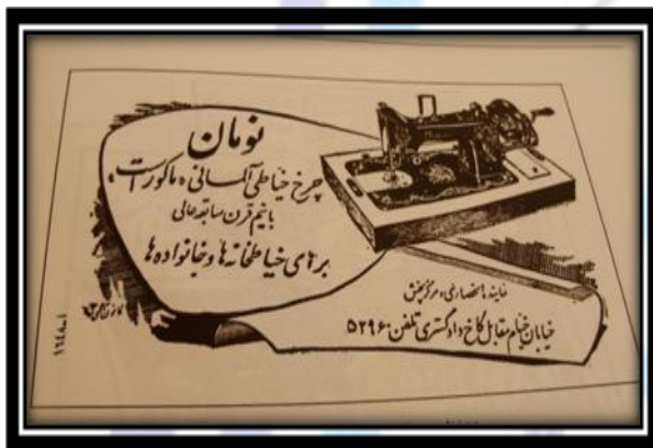
Image Exaggeration in Old Iranian Advertisement

In the above image analysis the first layer of text and message to be seen, "Neumann is a German sewing machine" "Makur", this is dependent to German. Germany has connotations for Iranian consumer. Common cultural and commercial fields between Germany and Iran, the same race, powerful industry and etc., all of them can attract the German word for Iranian consumer. This picture is black and white; concentration is more on the words.