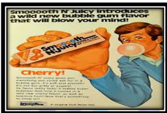
Image Exaggeration in Old Foreign Advertisement

The image is related to a chewing gum ad in the 1970s. According to Barthes in this picture, firstly, the text must be examined: on top of the image, Smooth N Juicy is written bold and black «introduces a wild new bubble gum flavor that will blow your mind». Name of product is Smooth N juicy and the picture is clear as a gum cherry flavor.