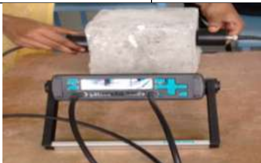
Fig 3 : Ultrasonic Pulse Velocity test