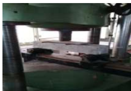
Figure 7: Flexural Strength test

For Flexural strength test, prism specimen of 100 mm X 100 mm X 500 mm was cast. For conventional and optimum mix, three prisms were cast and tested with two point load was applied.