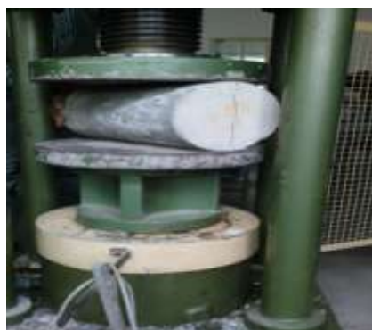
Fig 6: Split tensile Test