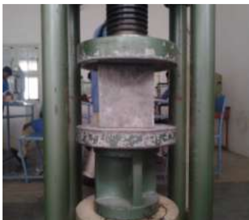
Fig 4 : Compressive Strength Test

In this test, six cubes (150 mm x 150 mm x 150 mm) were cast for each trial mix of M 60 concrete. For each mix three specimens after 7 days and another set of three specimens after 28 days of curing were tested for their compressive strength, using 2000 kN capacity compression testing machine.