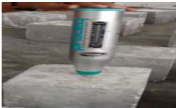
Fig 1 : Rebound Hammer Test