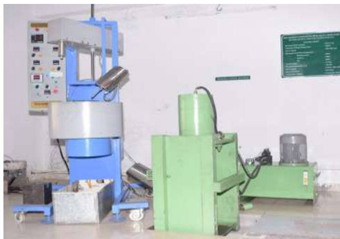
Figure 1 Experimental Setup