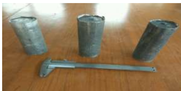
Figure 2 Casting samples

All process parameters were fixed at three levels within the above bounds to conduct experiments based on the L9(3)4 orthogonal array. The details of all parameters and their levels are given in Table 2. For each experimental condition, the casting samples were cast and are shown in Figure 2.