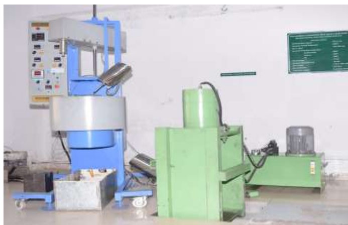
Figure 1 Experimental Setup