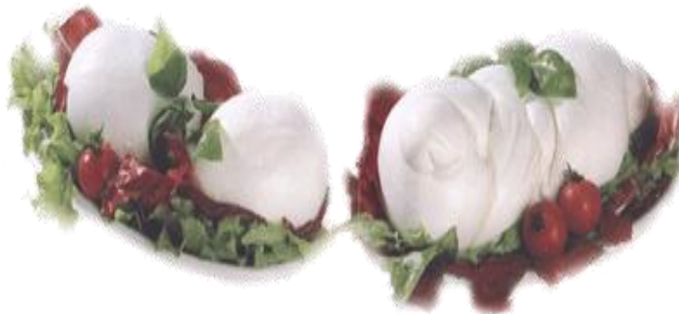
Fresh finished Buffalo's Mozzarella.