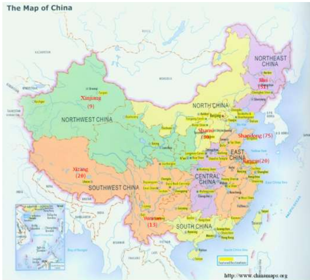
Fig. 1 Location of 218 E. coli strains isolated from China.

The number in red brackets stands for the quantity of E. coli strains obtained.