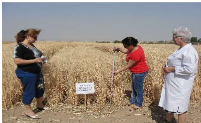
Note: Piping phase 06.07. 2019

As a visual manifestation of this, it is possible to satisfy the biometric measurements and phenological observations on the plant with the experimental variant, as a result of the prediction of the research we have undertaken under the sowing plant in the Shamakhi region of the region. [3,4]