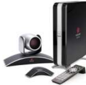
Fig. 1 Polycom HDX Series