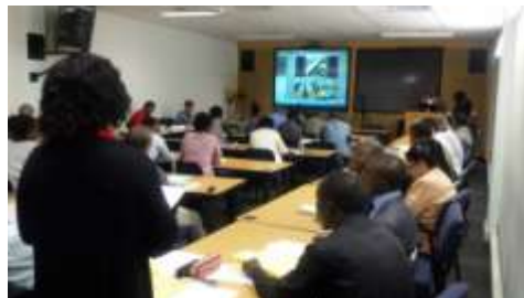
Fig. 3: Video Conferencing meeting

Some said "We students from Southern Campus scored above 70% and have 100% pass rate and remember, we have always trust in you Doctor." This seems to proof that students enjoyed the video conferencing of the subject. 'Human Anatomy and found it interesting. It is imperative to create a dictactic, conducive and learner friendly environment in which learner can interact with the lecturer, especially students live in geographically distant locations.