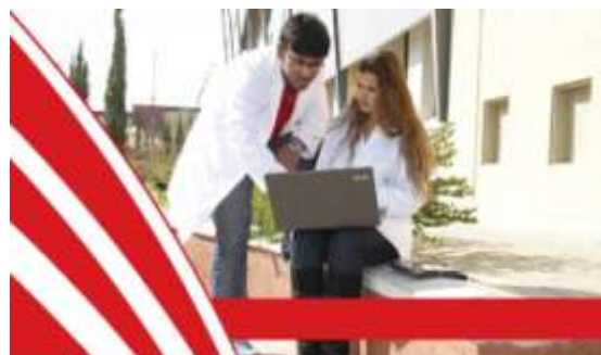
Fig. 3: Students on Campus