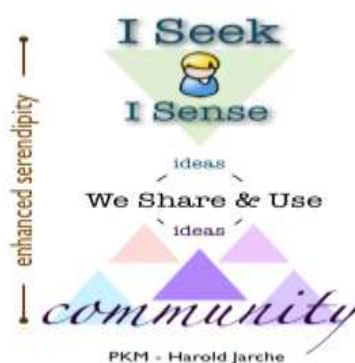
Fig1: Personal Knowledge Management framework

Social networking can be a very good medium for users to share links and resources, information and knowledge. Enormous resources are available at no cost to users in these learning networks. Based on interest and social motivations, users feel free to carry out the following activities: record their personal experiences regarding specific topics, post daily problems in learning or in the workplace, search for solutions, comment on others' posts, and give feedback and reflections on a specific posted story. This open and social environment that connects users with different knowledge and experiences can facilitate the process of knowledge creation, as well as organizing and sharing in very innovative ways.