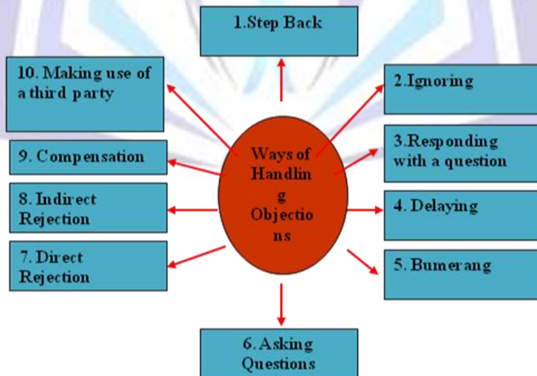
Figure 2 : Ways of Handling Objections ( Futrell, 2011: 385 ).

Salesman need to determine solutions to handle different kind of objections. As seen in Figure 2 , ways to handle the customer objections will be efficient to learn ( Bahçe, Uslu ve Sevim, 2013: 155 ).