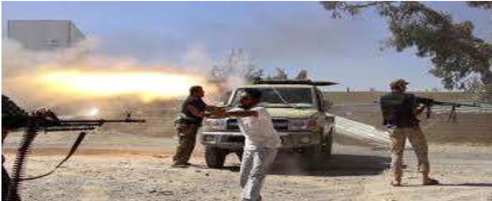
Figure 5: Rival Militias Fight for Eastern Libya's Group

Islamic State (IS) militants are said to have kidnapped nine foreign oil workers in a raid in Libya, when they reportedly beheaded eight guards. Four Filipinos, an Austrian, a Bangladeshi, a Czech and a Ghanaian were taken with an unidentified ninth foreigner, Austrian officials say. The foreign ministry in Vienna said IS had attacked the al-Ghani oil field. The foreigners were working for oilfield management company Value Added Oilfield Services (VAOS) at the field. VAOS said it did not know which militants had carried out the attack or where the oil workers had been taken (BBC News, 2015).