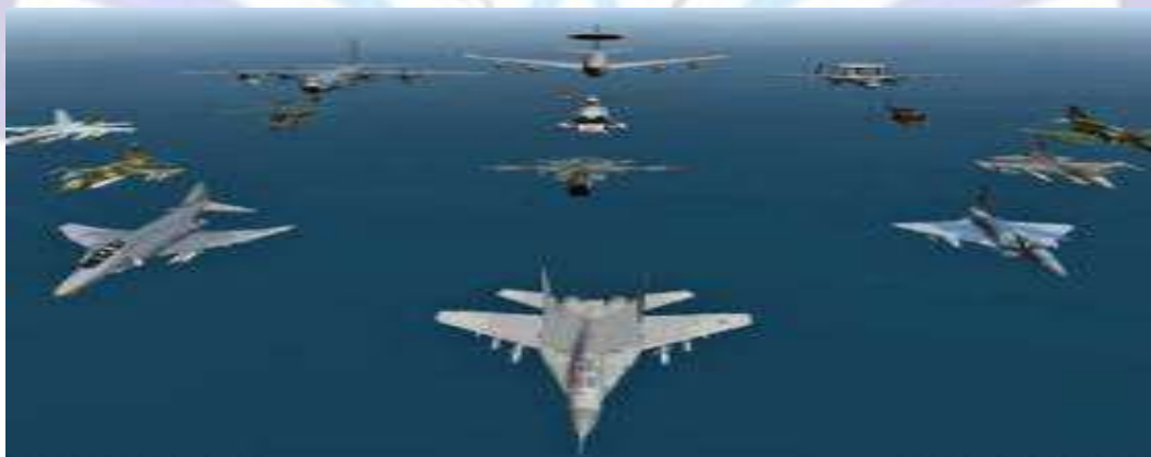
Figure 2. NATO Takes Command of Libya Operation as Allies Step Up Attacks

Early in 2011, the Libyan crisis escalated, proposing another test for NATO that has undergone further transformation since the 2010 Lisbon Summit (Barnes, 2011). The US has always played a dominant role in carrying out international interventions in regional conflicts, but in the case of Libya, the US apparently hesitated to unfold military operations against Libyan military targets. It seems to be the first time that the US followed rather than led its European allies to a campaign. Although the US eventually decided to participate, it announced the decision to transfer the Libyan mission to NATO immediately after the campaign. To understand why the US preferred 'leading from behind' in Libya, James Mann analyses the events, ideas, personalities and conflicts that have defined Obama's foreign policy (Barnes & Levinson, 2011). The debate over US commitment to NATO at this time is very serious, as the inherent problems of NATO were repeated in the post-Cold War period, firstly in Kosovo, then in Afghanistan, now peaking at Libya (Figure, 2).