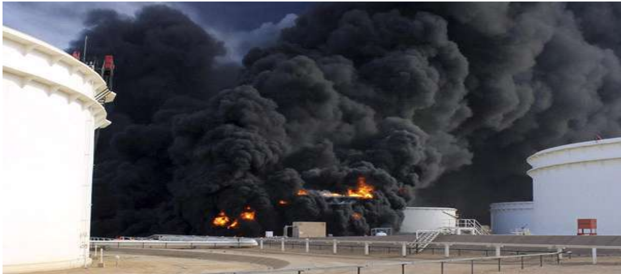
Figure 3. Seven of the 19 Oil Tanks at Al-Sidra were Ablaze

This photo shows the environmental and economic consequences as a result of this violence and destruction in the oil crescent area.