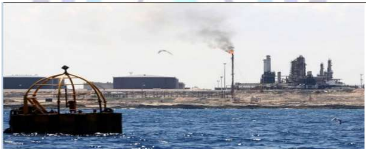
Figure 4. Another Gas Flaring Site at Residential Area in Eastern Libya Region

This photo shows the environmental and economic consequences as a result of this violence and destruction in the oil crescent area.