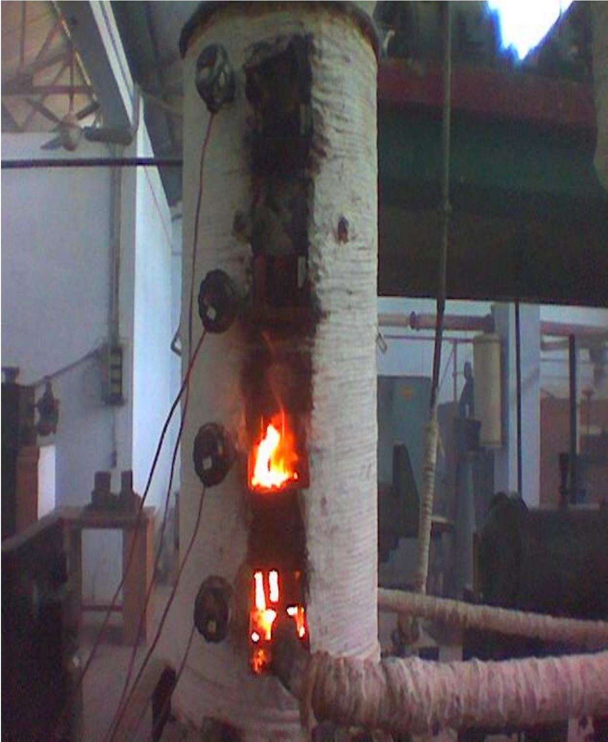
Figure:4 showing burning of briquettes

The carbonizer was designed in order to produce 5kg briquette charcoal from 15kg of inputs (agricultural wastes, grass, sugarcane trash and dry leaves is used in this experiment) and burns for about 25minutes. The manual extruder has a capacity of pressing 30kg/hr. The carbon content of briquette charcoal could be varied from 80% to as high as 82% or above by adjusting the carbonization condition, which depends on the amount and dryness of the input material to the Carbonizer. Since it loses its smoke inside the carbonizer during carbonization the briquette charcoal doesn't have smoke and burns cleanly due to very low sulfur content. The heating value of the briquette charcoal varies from 17,150 to 19,300 kcals with a density of 970kg/m 3 . Since it has a good heating value and higher density while briquetting it burns for about 2–3 hrs. The FBC system heat which can be used for power generation .