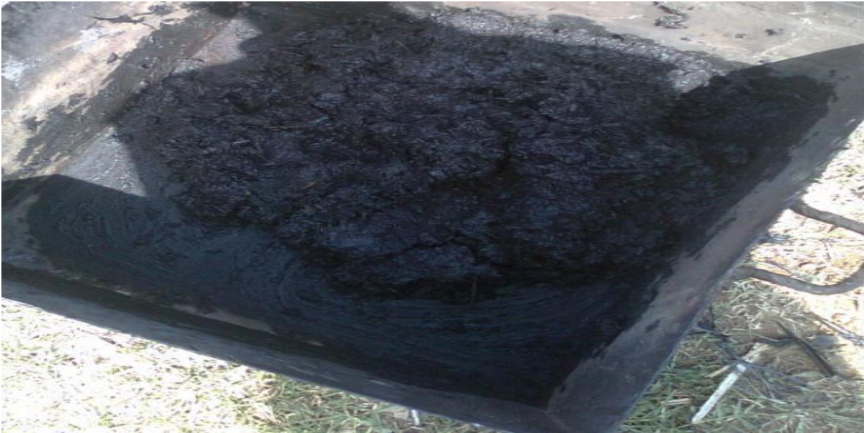
Fig.2. Carbonized charcoal mixed with the binder