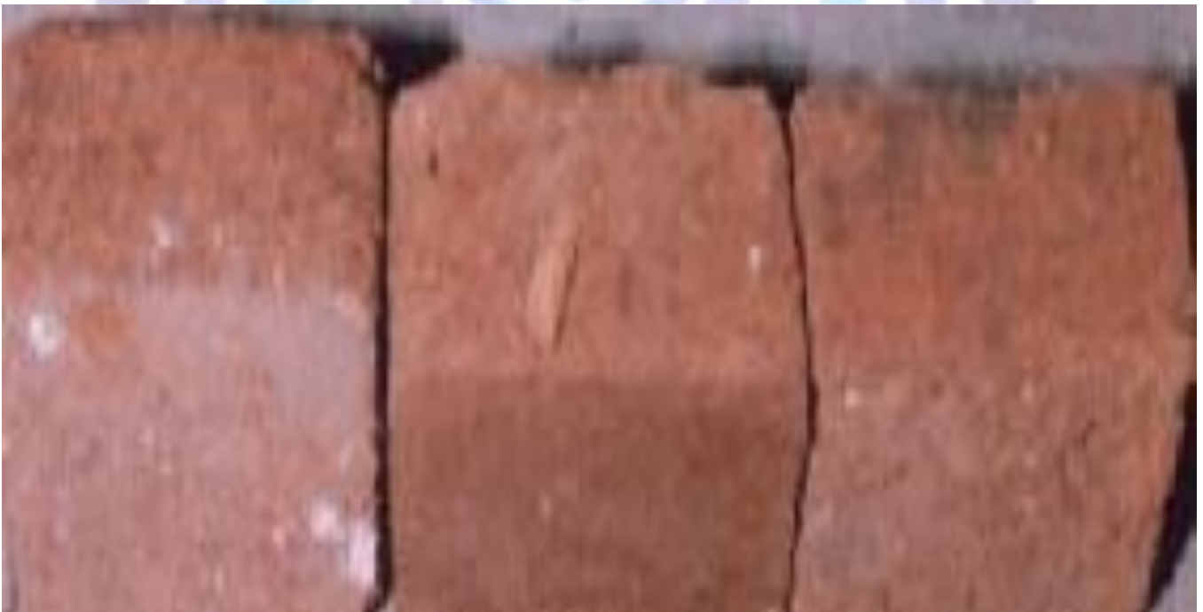
Briquettes before charcoal is made

The briquettes were collected in a tray dried under the sunlight for about 1-7 days, packed and sealed in plastic bags. The moisture must be removed by sun from the briquettes otherwise it is difficult for burning and reduces efficiency.