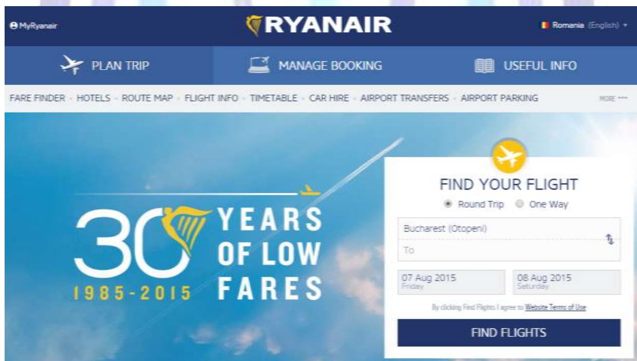
Fig.1. The Ryanair Company Official Homepage

This is the significant online publicity page on Internet for Ryanair, the first low fares airline, with an impressive profit amount of €193m, based on crews , bases, airplanes, routes and people to be transported.