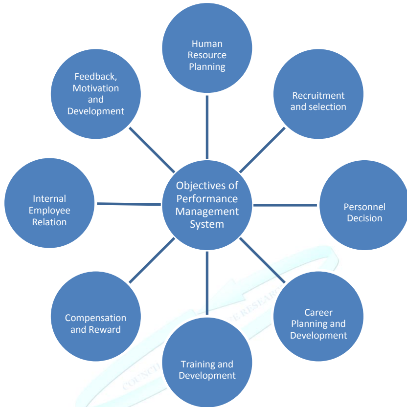
Fig-1 Uses and Objectives of Performance Management System