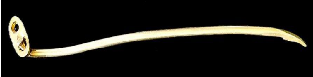
Figure 4. FRISK-G Stainless steel prototype.

FRISK-G is a general-purpose intramedullary system for fracture reduction and stabilization, suitable for the flexible fixation of long bones in children and adults. It is equally applicable to simple mid-diaphyseal fracture patterns of the clavicle. The FRISK-G design for the clavicle fractures can be pre-contoured to follow the curvature(s) of the clavicle anatomy, whether introduced antegrade or retrograde, depending on the site of the diaphyseal fracture.