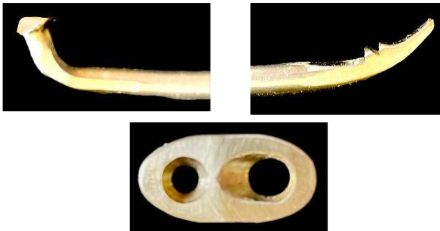
Figure 5 Coupling plate, knobbed headend and leading blunt barbed end.

The FRISK-G is a solid intramedullary implant ( Figure 4 ). The general design is reminiscent of a bicycle spoke. The head end has a 90-degree bend with a hemispherical knob. The leading end is curved and tapered, with a blunt, rounded tip to break the trabecular plates and columns. The curved back surface of the leading end is smooth and round, helping the FRISK-G 4 pin slide easily, skidding over the rough surface of the medullary canal and helping steer it through the curved space and displaced fracture ends. The opposite inner surface has 3-4 blunt fishhook barbs to engage into the cancellous bone of the far end fracture fragment. Although the presence of fishhook barbs is a dangerous design feature for the fixation of the clavicle fractures when crossing over to the far fragment, they provide anti-rotating and anti-sliding action once engaged into the far fragment. The blunt terminal end prevents easy penetration of the cortex.