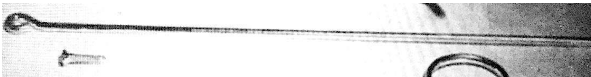
Figure 6. A modified Kirschner wire(Perry, 1966) with a loop at one end for an anti-rotation screw, preventing migration and extrusion of the wire.

The intramedullary internal fixation device for clavicle fractures was first introduced in 1940(Murray, 1940; Perry, 1966). Since then, the intramedullary implants of various designs, from simple Kirschner wire modifications to threaded Steinmann pins, smooth Titanium elastic nails, fully threaded AO screws, cannulated partially threaded AO lag screws, and headless Herbert-type solid and cannulated screws for compression have been introduced, with growing success and acceptance for the realignment and stability of the clavicle fractures. At the same time, small-diameter smooth K-wires, Titanium elastic nails, and threaded Steinmann pins have proven troublesome because of migration, sharp cut ends, tenting the skin, causing irritation, skin breakdown, serous discharge with or without superficial wound infection, and extrusion, leading to the early removal of the failed implant. These issues have cast doubt on the success and feasibility of intramedullary implants.