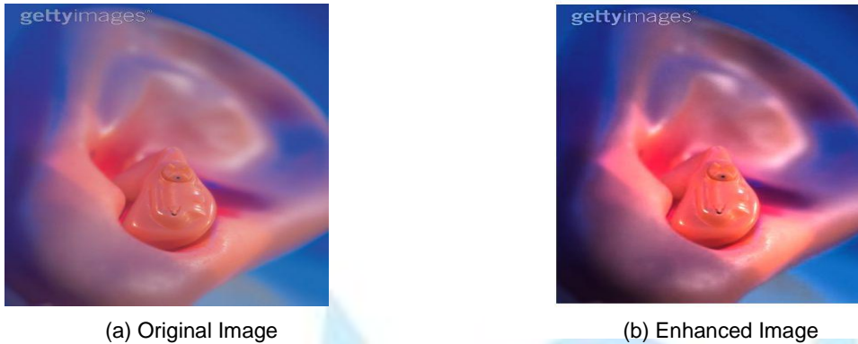
Fig-3: Result of application of our method color medical image

As you can observe that enhanced image is visually more effective for clinical diagnosis than the original image.