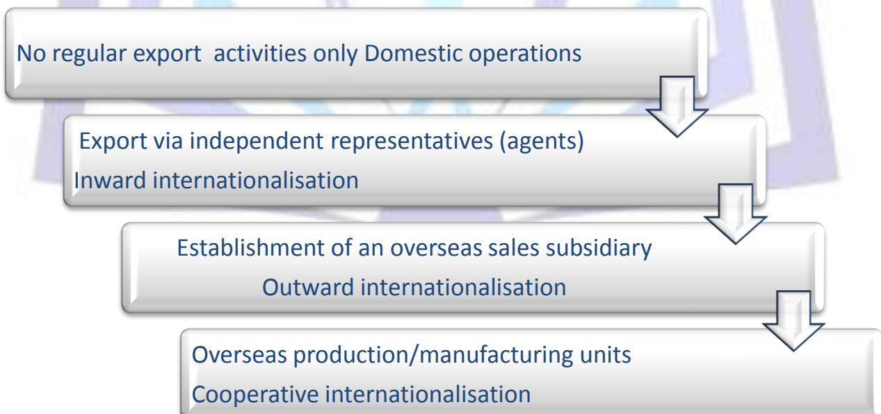
Figure-2-Pattern of internationalization by SMEs developed based on U-model and Elo (2005).

Below illustrated model in figure 2 presents the review of theories in incremental internationalization. As explained in Uppsala model, firms increase their international involvement in small incremental steps. The model illustrated below present (summarize) the process SMEs' follow to expand their business in international market as presented by several authors.