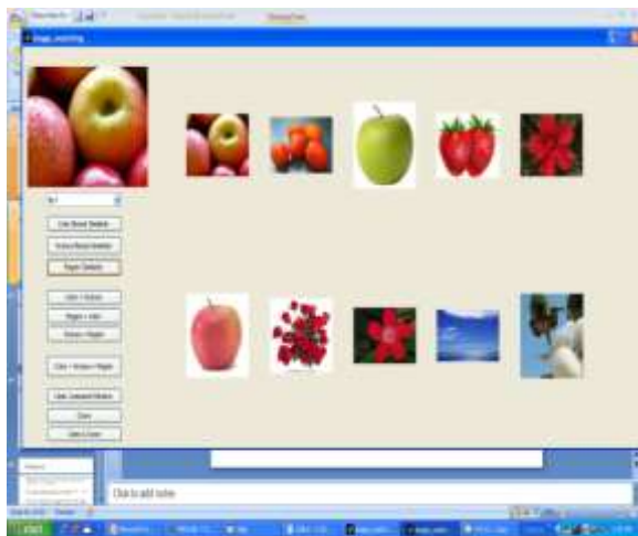
Fig4:Shape Based Similarity