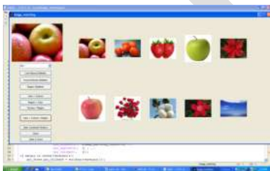
Fig5:Combination of texture, color and shape Similarity

The GLCM for texture is the better method as compared to that with gabor and wavelet. The methods used for calculating the output is precision, recall and accuracy. The output obtained is as shown: