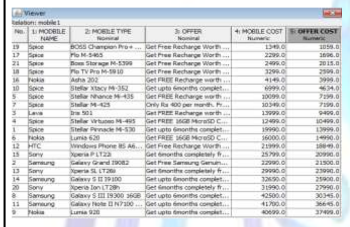
Fig 3c: Extarcted information