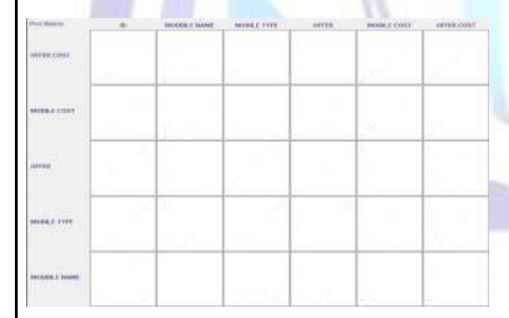
Fig 3e: compative analysis between mobile attributes