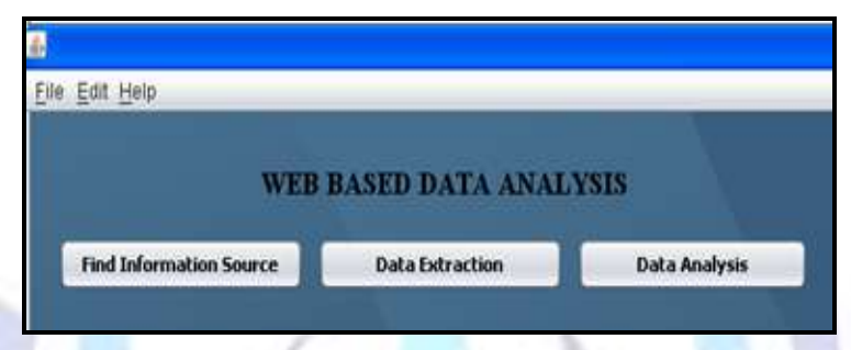
Fig 2: System interface