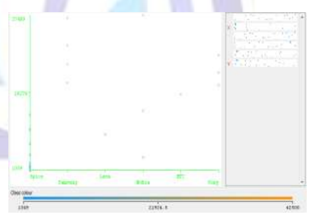
Fig 3f: scattered analysis between brands and their costs